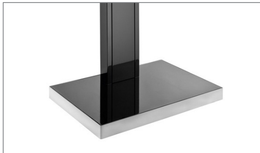
concealed castors, high-gloss surface